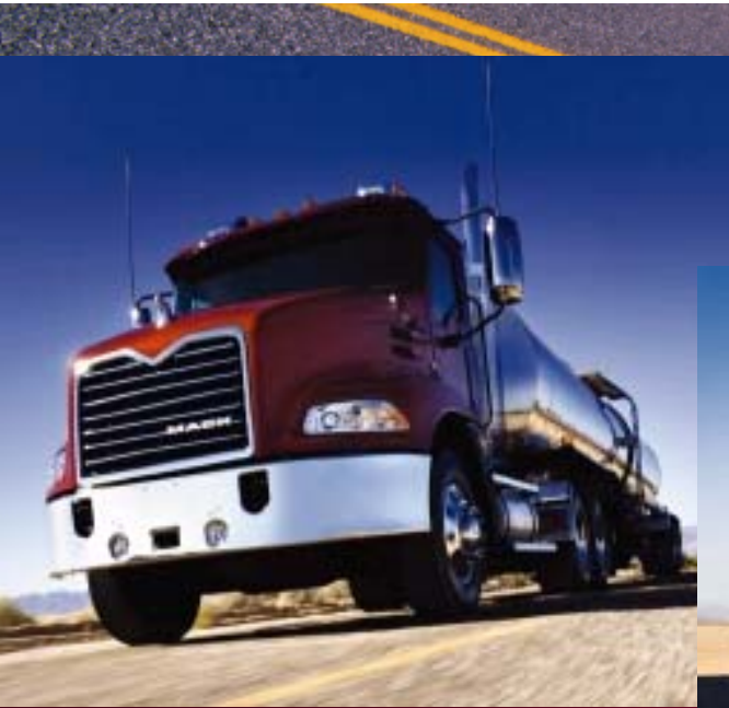
Economic Haul #2