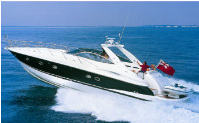
Marine Leisure 65%