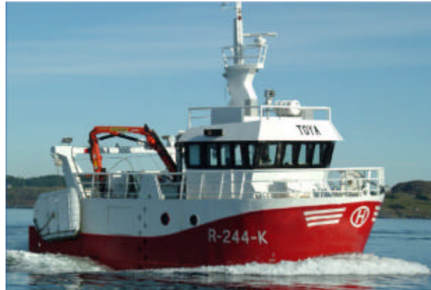
Marine Commercial 10%