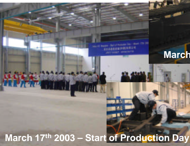
March 17 th 2003 – Start of Production Day