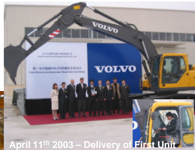
April 11 th 2003 – Delivery of First Unit