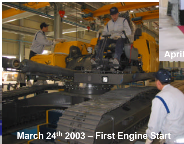
March 24 th 2003 – First Engine Start