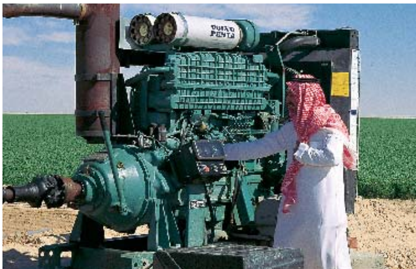
Net sales by market area, Volvo Penta

The order situation for leisure-boat and marine-commercial engines was relatively stable during the period. Volvo Penta's order bookings within these segments remained at approximately the same level as a year earlier. Although a distinct decline was noted in orders received for industrial engines, due to the downturn in the total market, Volvo Penta's combined order bookings during the first nine months remained at a historically high level.