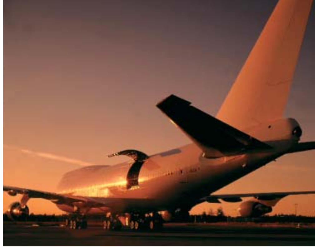
Net sales by market area, Volvo Aero

As an effect of the aviation industry crisis, the orders for components for new aircraft engines declined sharply compared with the corresponding period a year earlier. During the third quarter, the decline